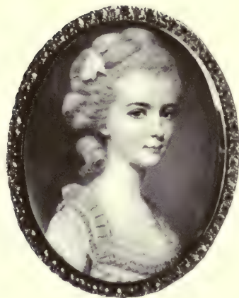
PORTRAIT OF A LADY (NAME UNKNOWN) BY JOHN SMART